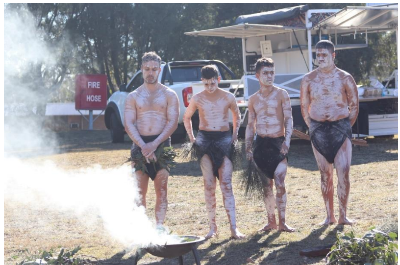
Local 1 st Nations’s dancers from Waagan Galga