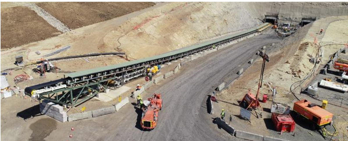
Whynot mine entry conveyor