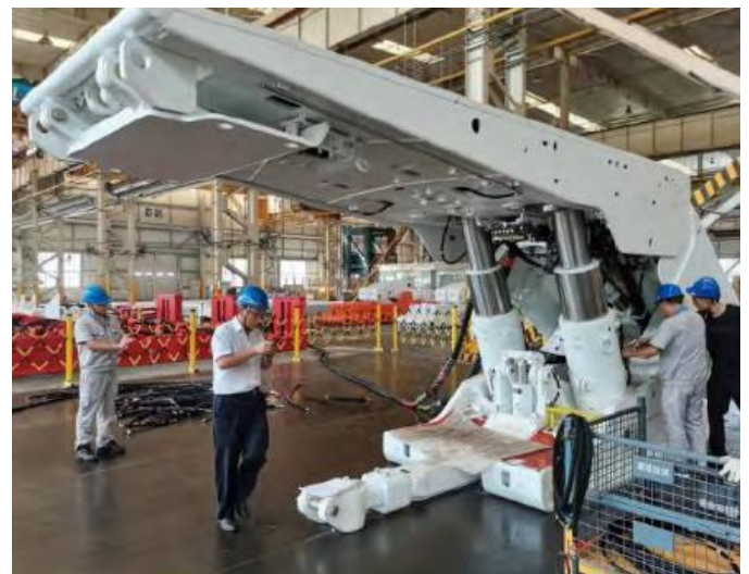
First roof support for the Woodlands Hill Longwall