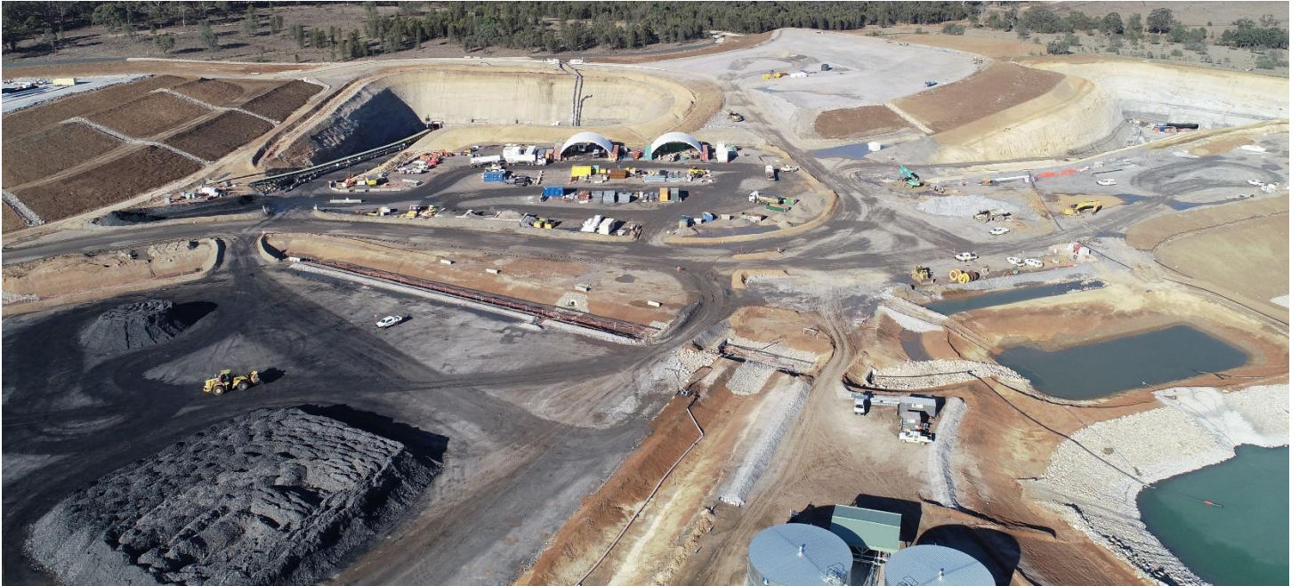
Mine Entry Area October 2023