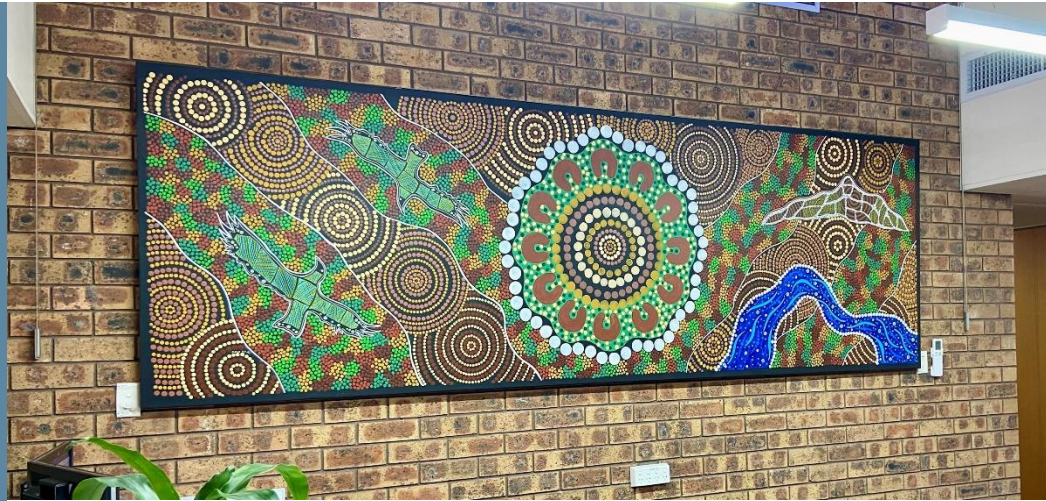
New artwork at Maxwell painted by local 1 st Nation's artist