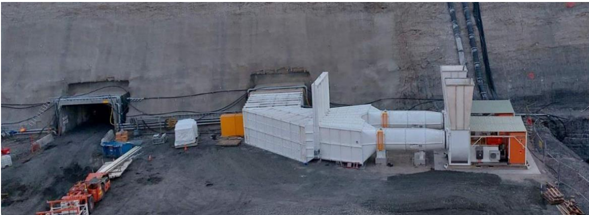
Whynot Ventilation fan