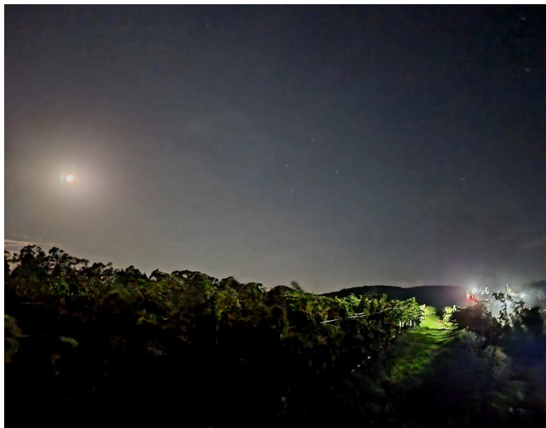
Full moon 2023 harvest

Our Merton Vineyard has produced another great harvest of Chardonnay, Shiraz and Verdelho with all grapes being presold to local wineries or processed at our winery by Small Forest Wines. smallforest.com.au