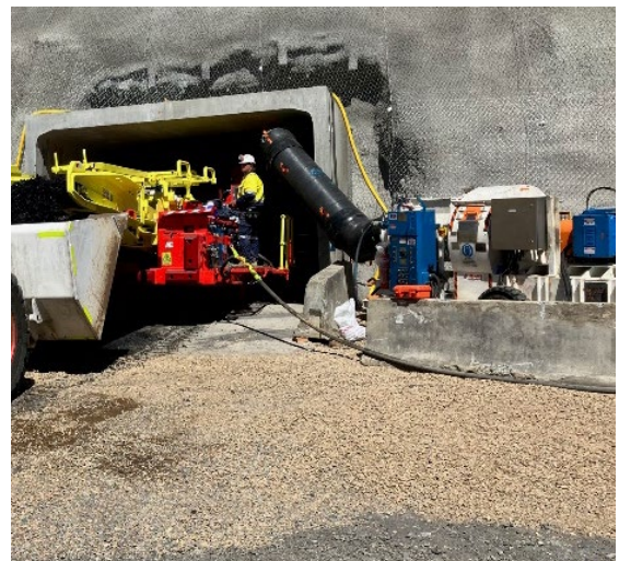
Continuous miner operating in a Whynot entry