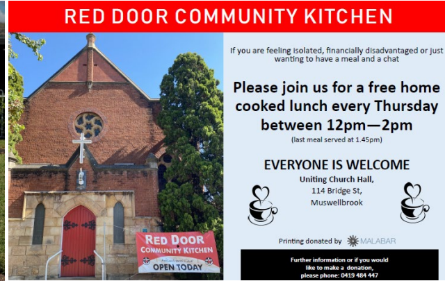
Red Door Community Sponsorship.