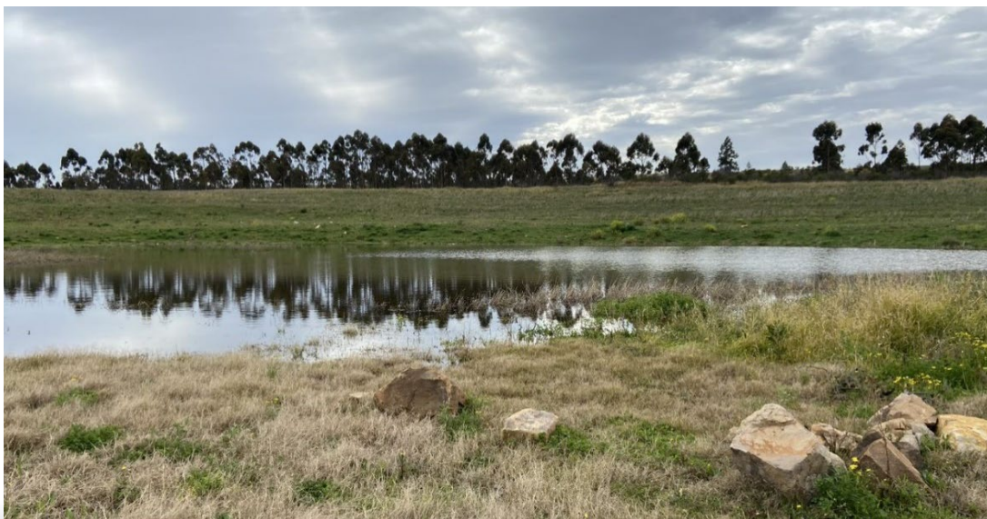
Wetlands created on land rehabilitated at the Maxwell Mine

During the quarter, Malabar continued to rehabilitate substantial portions of the land that had previously been used for open cut coal mining. Rehabilitation is now well advanced on more than 850 hectares of land.