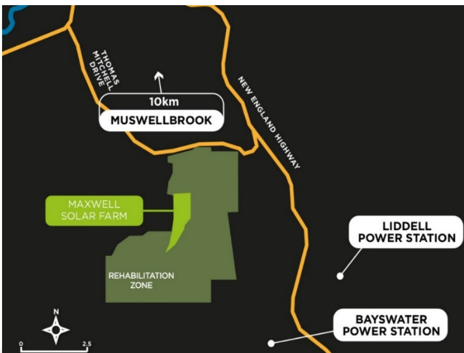
Proposed sight for Maxwell Solar Stage 1.

We are considering partnering to realise the opportunity (i.e. up to c. 400MW +/-).