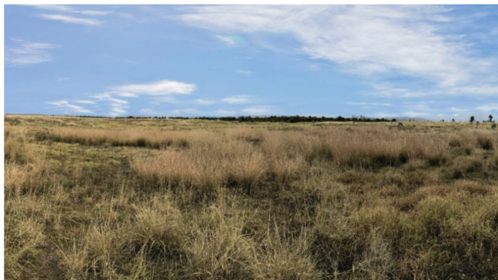
Partially rehabilitated land on the old Drayton Mine site.

Working at capacity, the solar farm would generate enough energy from the sun to power about 10,000 local homes.