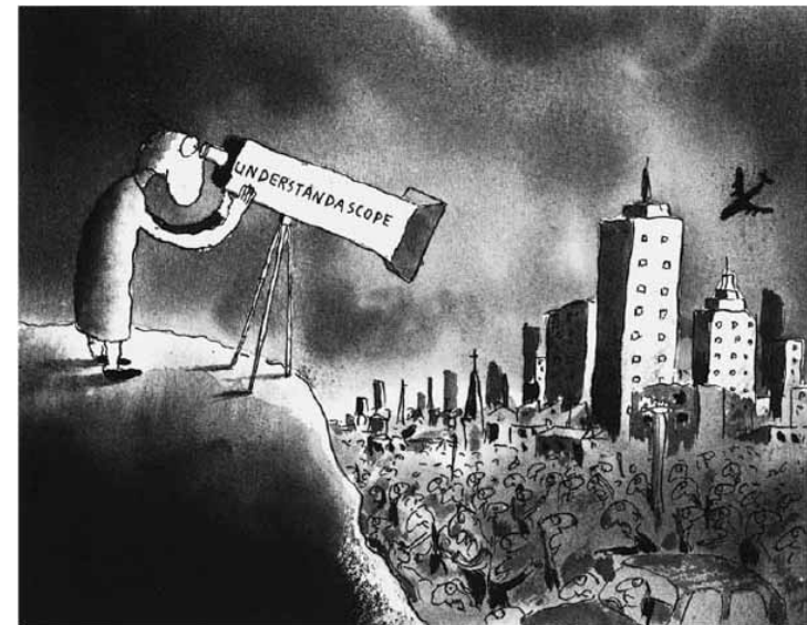
The Understandascope (c) Michael Leunig 2010